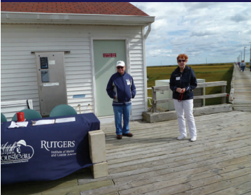
Volunteers greet visitors at the 2011 RUMFS Open House

Below: Ulva (sea lettuce) covering seagrass. With excess nutrients, Ulva overgrows and shades out seagrass.