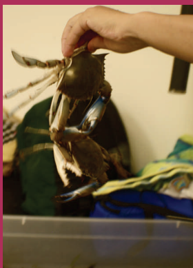
Wrangling Blue Crabs at RUMFS.

“Those who can handle the summer insects, heat, and mud would be encouraged to join this project!”