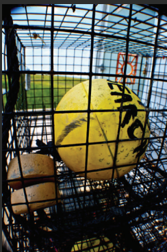
Crab Traps

“The 1916 Shark attacks off the NJ Coast are believed to be the inspiration behind the story, Jaws .”