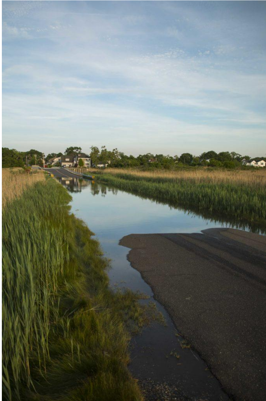
Compton Creek, Port Monmouth by Gina Ziegler View on MyCoast (link: https://mycoast.org/reports/70140 )