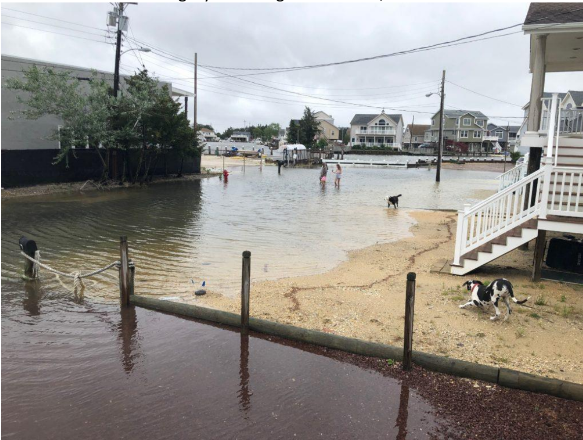
Tuckerton Creek, Little Egg Harbor Township